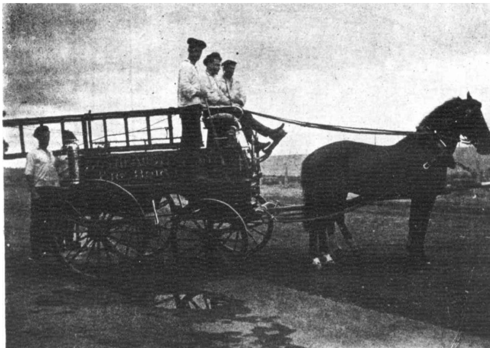
A NEW TYPE OF FIRE BRIGADE WAGGON AT PORT PIRIE, DESIGNED BY SUPT. RICKWOOD.

Express and Telegraph (Adelaide, SA : 1867 - 1922), Wednesday 15 July 1908, page 1